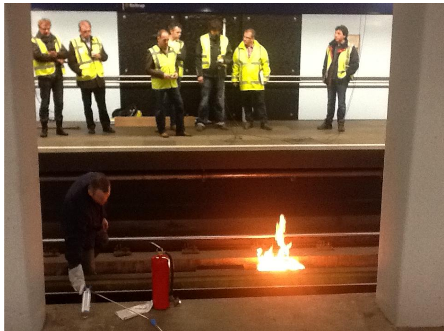
Heat detection test in the Rotterdam Metro

The advantages of a DTS system over conventional point detection systems ensure the highest possible degree of security – for the infrastructure itself, as well as for the personal safety of passengers and employees. The sensor cable is immune to dirt, dust, humidity and corrosive atmospheres, and offers the unique ability to operate at very high temperatures of over 750 °C for over two hours (functional integrity as per IEC 60331-25).